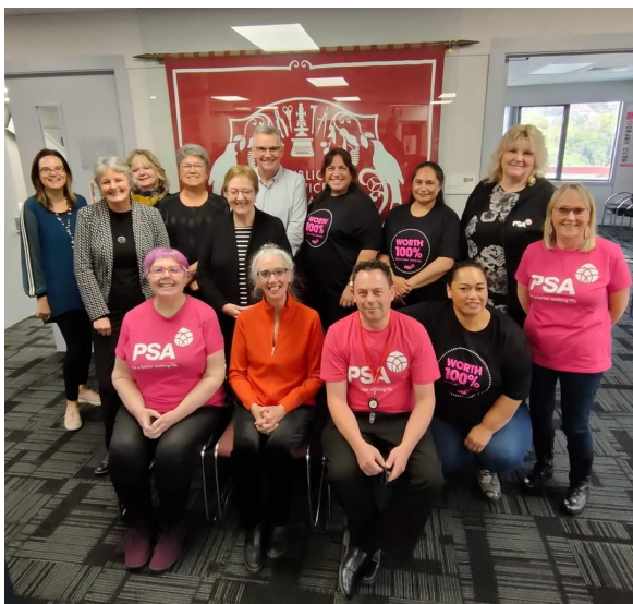
Pictured right: Members of the social work pay equity claim bargaining team.

From the start of the claim, SSPA, together with the five employers and the PSA, has consistently advocated that any settlement needed to extend to people in social work roles across our whole community-based social services sector. So it was fantastic news in November when Government announced its decision to extend the settlement on this basis. This will make a huge difference for kaimahi and the people who they work with every day. The extension will have a strengthening effect for the social sector. We continue working closely with the PSA, Te Kawa Mataaho and our members on the mahi required to make the extension happen as soon as possible in 2023.