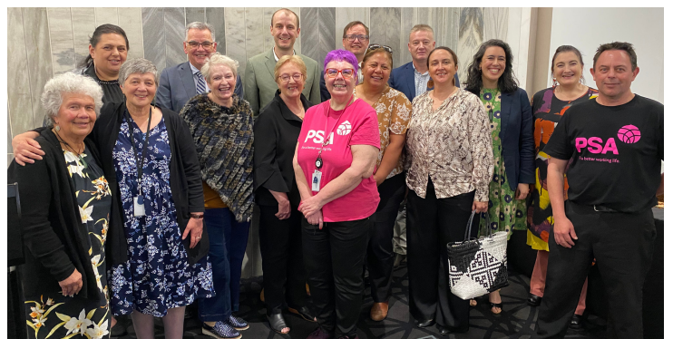
Pictured below: Social work and social services leaders, union representatives and government officials welcoming the pay equity settlement extension announcement at Parliament.