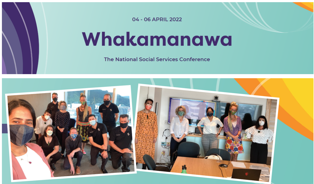
Pictured above: The team behind the scenes of Whakamanawa 2022 - rising to the challenge of delivering a national online Conference during the pandemic.

Sincere thanks to all those who attended, our Whakamanawa '22 Photo Challenge participants, our kaikōrero, and our generous sponsors Careerforce, Te Rau Ora and Simpson Grierson.